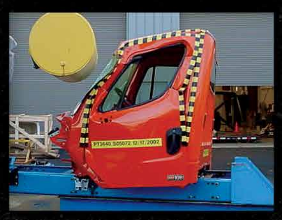
Components, systems and entire vehicles are subjected to an array of virtual and physical tests to ensure our trucks deliver the expected function, performance and reliability.